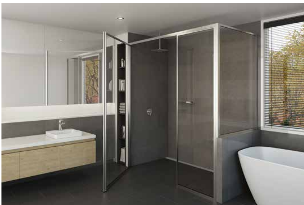
Affinity 18 Fully Framed Shower

The Affinity fully framed system is patented and manufactured from the highest quality brass, stainless steel pin and nylon insert. The Affinity full opening pivot inserts into the back edge of the door, ensuring a full opening door for all shower screen applications.