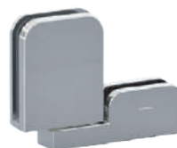
Brushed Satin Nickel