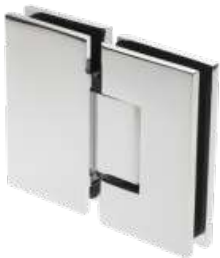
Glass to Glass Hinge Square Edge