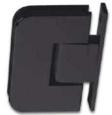
Frame to Glass Hinges

Refer to Danmac website for full hardware range