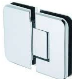
Glass to Glass Hinge Radius Edge