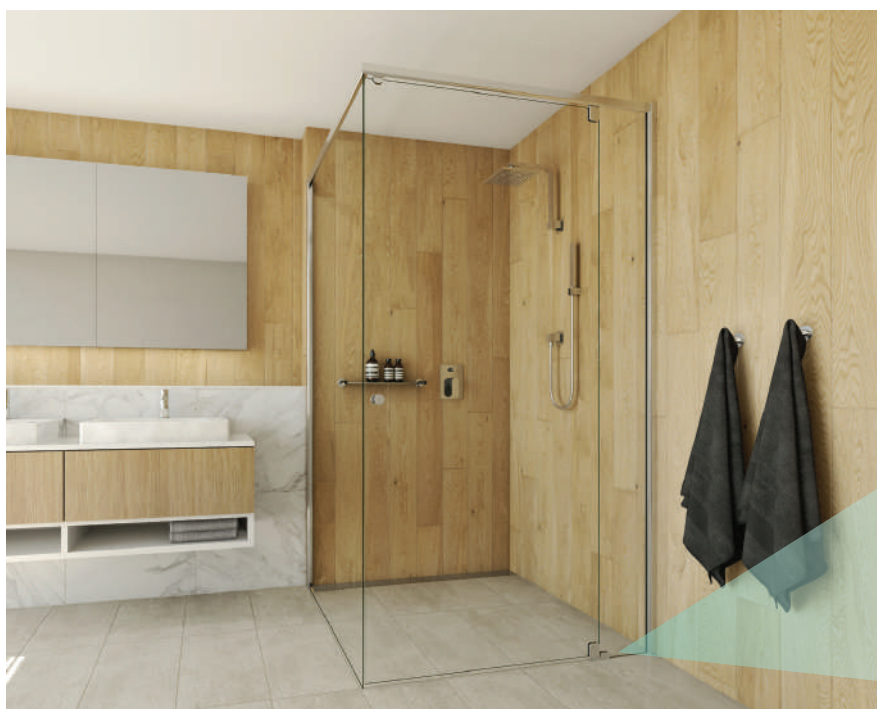
Ultimate Pivot Clamp Sill-less