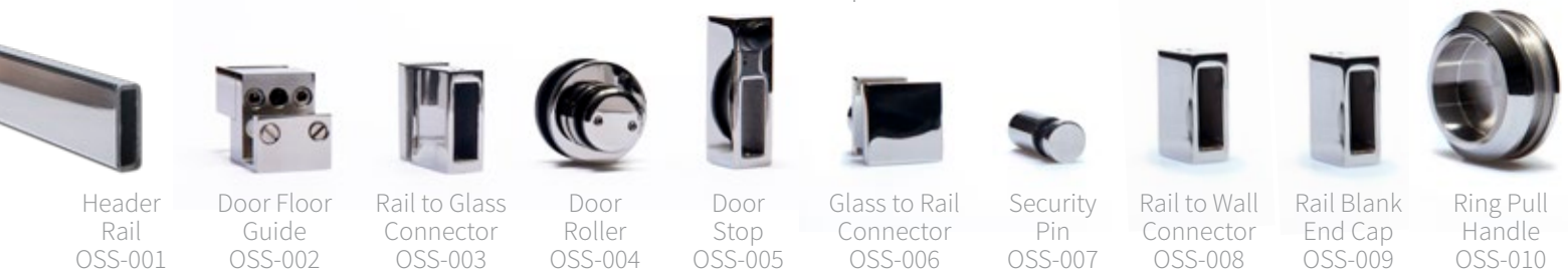
Header Rail OSS-001