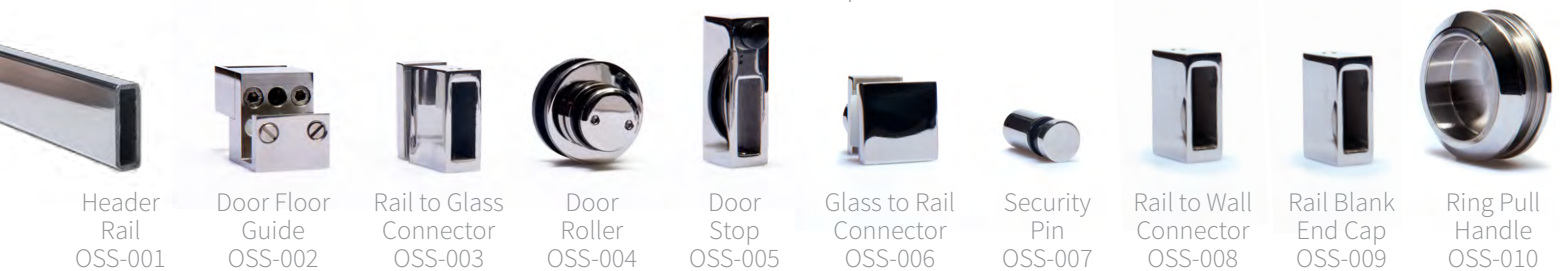
Header Rail OSS-001